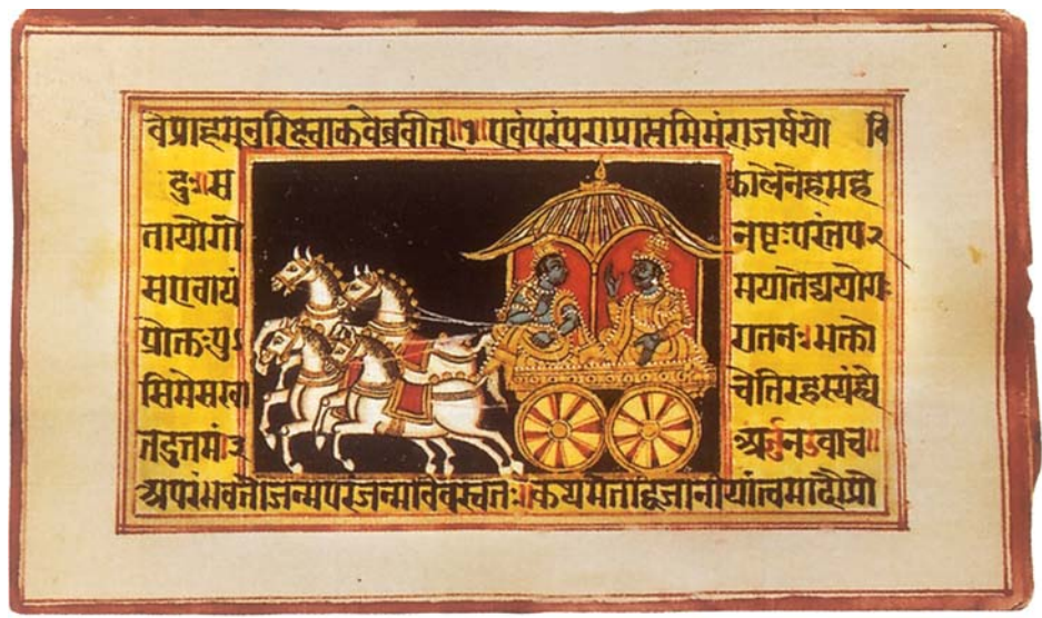
Fig. 1 A page from a south Indian manuscript of the Bhagavadgita.

The seventh to ninth centuries saw the emergence of new religious movements, led by the Nayanars (saints devoted to Shiva) and Alvars (saints devoted to Vishnu) who came from all castes including those considered “untouchable” like the Pulaiyar and the Panars. They were sharply critical of the Buddhists and Jainas and preached ardent love of Shiva or Vishnu as the path to salvation. They drew upon the ideals of love and heroism as found in the Sangam literature (the earliest example of Tamil literature, composed during the early centuries of the Common Era) and blended them with the values of bhakti. The Nayanars and Alvars went from place to place composing exquisite poems in praise of the deities enshrined in the villages they visited, and set them to music.