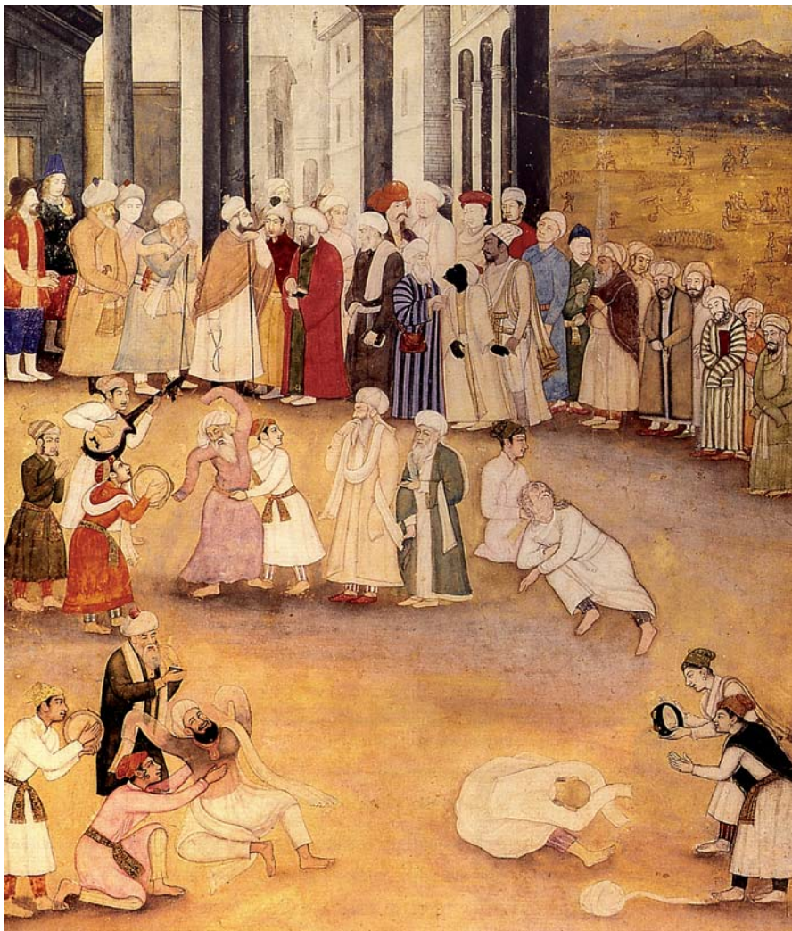
Fig. 4 Mystics in ecstasy.

with a disregard for the world. Like the saint-poets, the Sufis too composed poems expressing their feelings, and a rich literature in prose, including anecdotes and fables, developed around them. Among the great Sufis of Central Asia were Ghazzali, Rumi and Sadi. Like the Nathpanthis, Siddhas and Yogis, the Sufis too believed that the heart can be trained to look at the world in a different way. They developed elaborate methods of training using zikr (chanting of a name or sacred formula), contemplation, sama (singing), raqs (dancing), discussion of parables, breath control, etc. under the guidance of a master or pir . Thus emerged the silsilas , a genealogy of Sufi teachers, each following a slightly different method ( tariqa ) of instruction and ritual practice.