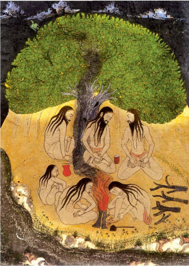
Fig. 3 A fireside gathering of ascetics.

A number of religious groups that emerged during this period criticised the ritual and other aspects of conventional religion and the social order, using simple, logical arguments. Among them were the Nathpanthis, Siddhacharas and Yogis. They advocated renunciation of the world. To them the path to salvation lay in meditation on the formless Ultimate Reality and the realisation of oneness with it. To achieve this they advocated intense training of the mind and body through practices like yogasanas , breathing exercises and meditation. These groups became particularly popular among “low” castes. Their criticism of conventional religion created the ground for devotional religion to become a popular force in northern India.