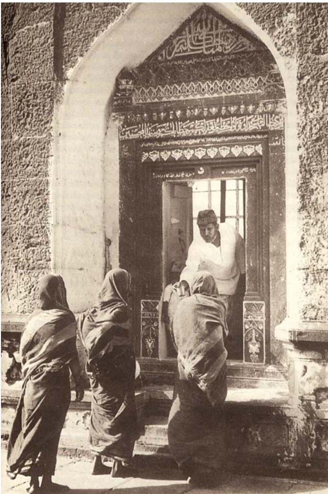
Fig. 6 Devotees of all backgrounds visit Sufi shrines.

Often people attributed Sufi masters with miraculous powers that could relieve others of their illnesses and troubles. The tomb or dargah of a Sufi saint became a place of pilgrimage to which thousands of people of all faiths thronged.