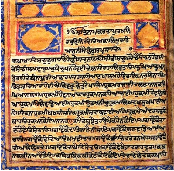
Fig. 11 An early manuscript of the Guru Granth Sahib.

a new script known as Gurmukhi. The three successors of Guru Angad also wrote under the name of “Nanak” and all of their compositions were compiled by Guru Arjan in 1604. To this compilation were added the writings of other figures like Shaikh Farid, Sant Kabir, Bhagat Namdev and Guru Tegh Bahadur. In 1706 this compilation was authenticated by his son and successor, Guru Gobind Singh. It is now known as Guru Granth Sahib , the holy scripture of the Sikhs.