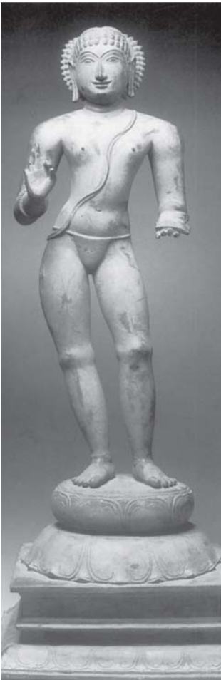
Fig. 2 A bronze image of Manikkavasagar.

Between the tenth and twelfth centuries the Chola and Pandya kings built elaborate temples around many of the shrines visited by the saint-poets, strengthening the links between the bhakti tradition and temple worship. This was also the time when their poems were compiled. Besides, hagiographies or religious biographies of the Alvars and Nayanars were also composed. Today we use these texts as sources for writing histories of the bhakti tradition.