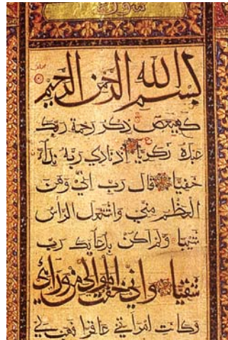
Fig. 5 A page from a manuscript of the Quran, Deccan, late fifteenth century.

Hospice House of rest for travellers, especially one kept by a religious order.