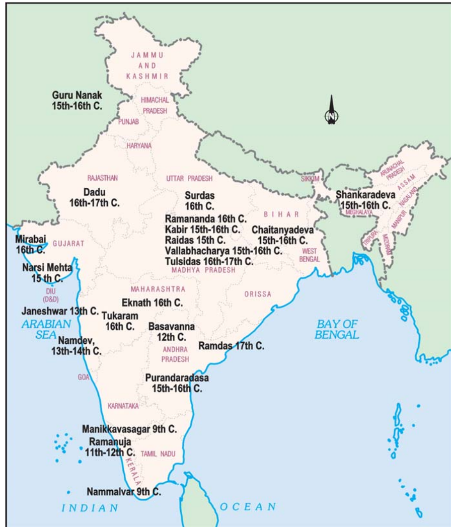
Map 1 Major bhakti saints and the regions associated with them.

expression of his devotion and as a literary work. Surdas was an ardent devotee of Krishna. His compositions, compiled in the Sursagara , Surasaravali and Sahitya Lahari , express his devotion. Also contemporary was Shankaradeva of Assam (late fifteenth century) who emphasised devotion to Vishnu, and composed poems and plays in Assamese. He began the practice of setting up namghars or houses of recitation and prayer, a practice that continues to date.