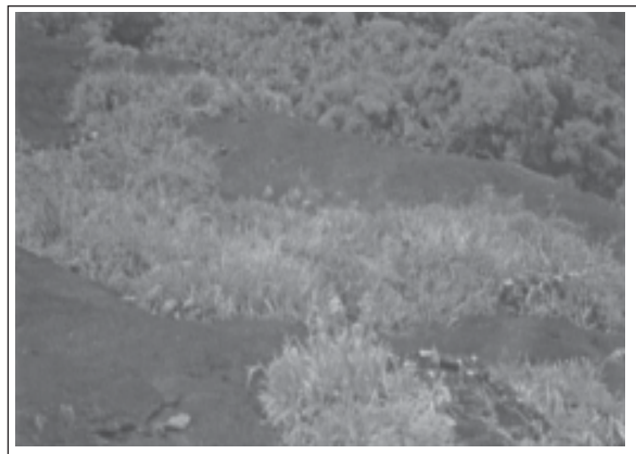
Figure 16.3 : Zenkeria Sebastinei — a critically endangered grass in Agasthiyamalai peak (India)