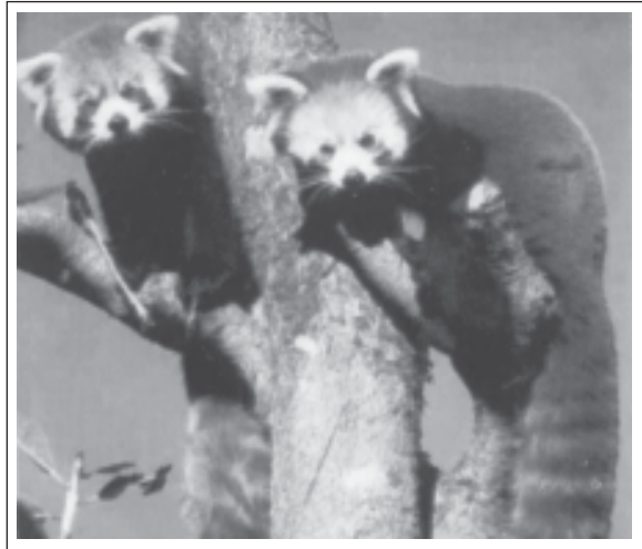
Figure 16.2 : Red Panda — an endangered species

It includes those species which are in danger of extinction. The IUCN publishes information about endangered species world-wide as the Red List of threatened species.