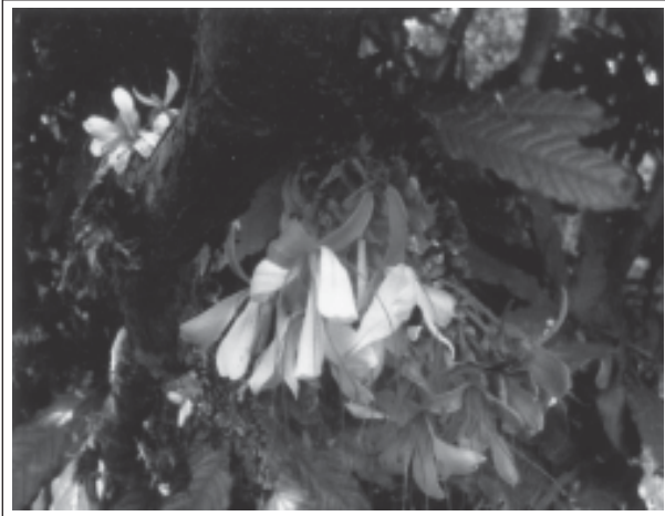
Figure 16.4 : Humboldtia decurrens Bedd — highly rare endemic tree of Southern Western Ghats (India)

Population of these species is very small in the world; they are confined to limited areas or thinly scattered over a wider area.