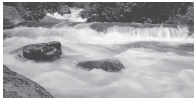
Figure 3.3 : Rapids

The Himalayan drainage system has evolved through a long geological history. It mainly includes the Ganga, the Indus and the Brahmaputra river basins. Since these are fed both by melting of snow and precipitation, rivers of this system are perennial. These rivers pass through the giant gorges carved out by the erosional activity carried on simultaneously with the uplift of the Himalayas. Besides deep gorges, these rivers also form V-shaped valleys, rapids and waterfalls in their mountainous