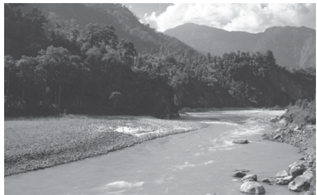
Figure 3.1 : A River in the Mountainous Region

2006) in this class. Can you, then, explain the reason for water flowing from one direction to the other? Why do the rivers originating from the Himalayas in the northern India and the Western Ghats in the southern India flow towards the east and discharge their waters in the Bay of Bengal?