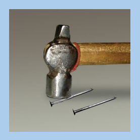
Fig. 4.1: Beating an iron nail with hammer also the aluminium wire. Then repeat the same kind of treatment on the coal piece and pencil lead. Record your observations in Table 4.2.

Take a small iron nail, a coal piece, a piece of thick aluminium wire and a pencil lead. Beat the iron nail with a hammer (Fig. 4.1). (But take care that you don't hurt yourself in the process). Try to hit hard. Hit hard