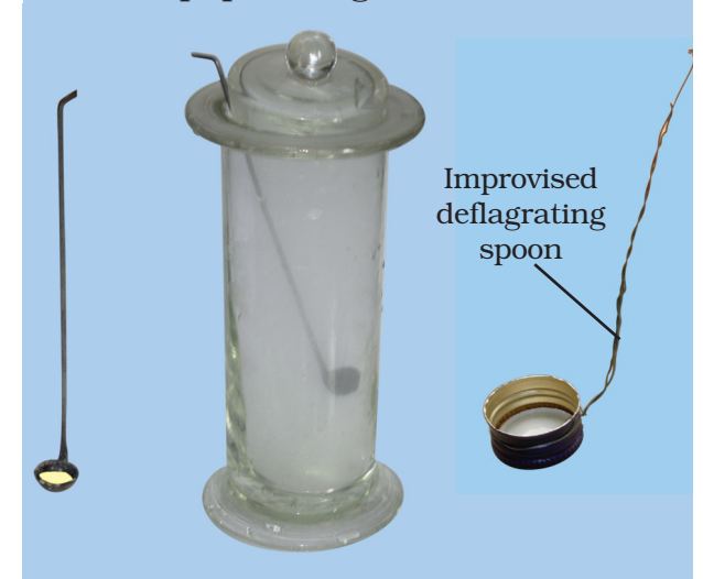
Fig. 4.4 (a): Burning of sulphur powder

As soon as sulphur starts burning, introduce the spoon into a gas jar/glass tumbler [Fig. 4.4 (a)]. Cover the tumbler with a lid to ensure that the gas produced does not escape. Remove the spoon after some time. Add a small quantity of water into the tumbler and quickly replace the lid. Shake the tumbler well. Check the solution with red and blue litmus papers [Fig. 4.4 (b)].