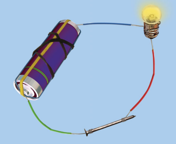
Fig. 4.2: Electric tester

Recall how to make an electric circuit to test whether electricity can pass through an object or not (Fig. 4.2). You might have performed