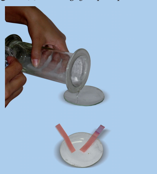
Fig. 4.4 (b) : Testing of solution with litmus papers