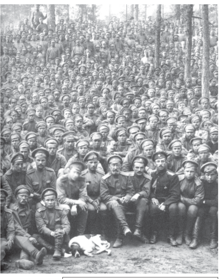
Fig.7 – Russian soldiers during the First World War.

The war also had a severe impact on industry. Russia's own industries were few in number and the country was cut off from other suppliers of industrial goods by German control of the Baltic Sea. Industrial equipment disintegrated more rapidly in Russia than elsewhere in Europe. By 1916, railway lines began to break down. Able-bodied men were called up to the war. As a result, there were labour shortages and small workshops producing essentials were shut down. Large supplies of grain were sent to feed the army. For the people in the cities, bread and flour became scarce. By the winter of 1916, riots at bread shops were common.