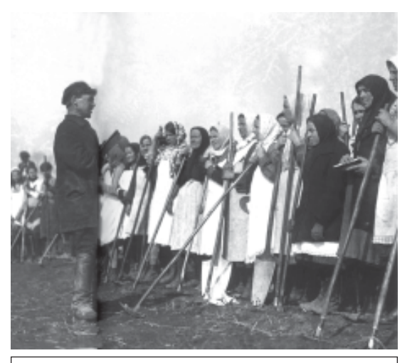
Fig. 19 – Peasant women being gathered to work in the large collective farms.