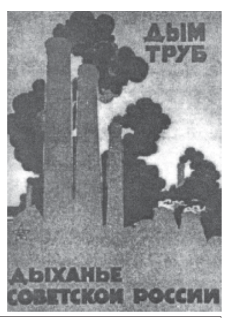
Fig. 14 – Factories came to be seen as a symbol of socialism. This poster states: 'The smoke from the chimneys is the breathing of Soviet Russia.'

An extended schooling system developed, and arrangements were made for factory workers and peasants to enter universities. Crèches were established in factories for the children of women. Cheap public health care was provided. Model living quarters were set up for workers. The effect of all this was uneven, though, since government resources were limited.