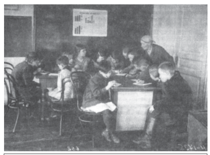
Fig.15 – Children at school in Soviet Russia in the 1930s.