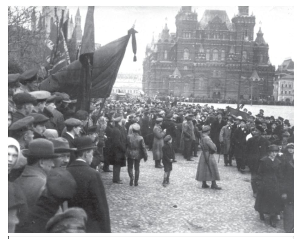
Fig. 13 - May Day demonstration in Moscow in 1918.