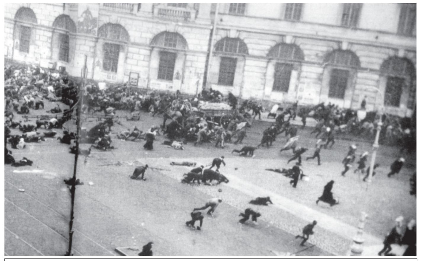
Fig. 10 - The July Days. A pro-Bolshevik demonstration on 17 July 1917 being fired upon by the army.