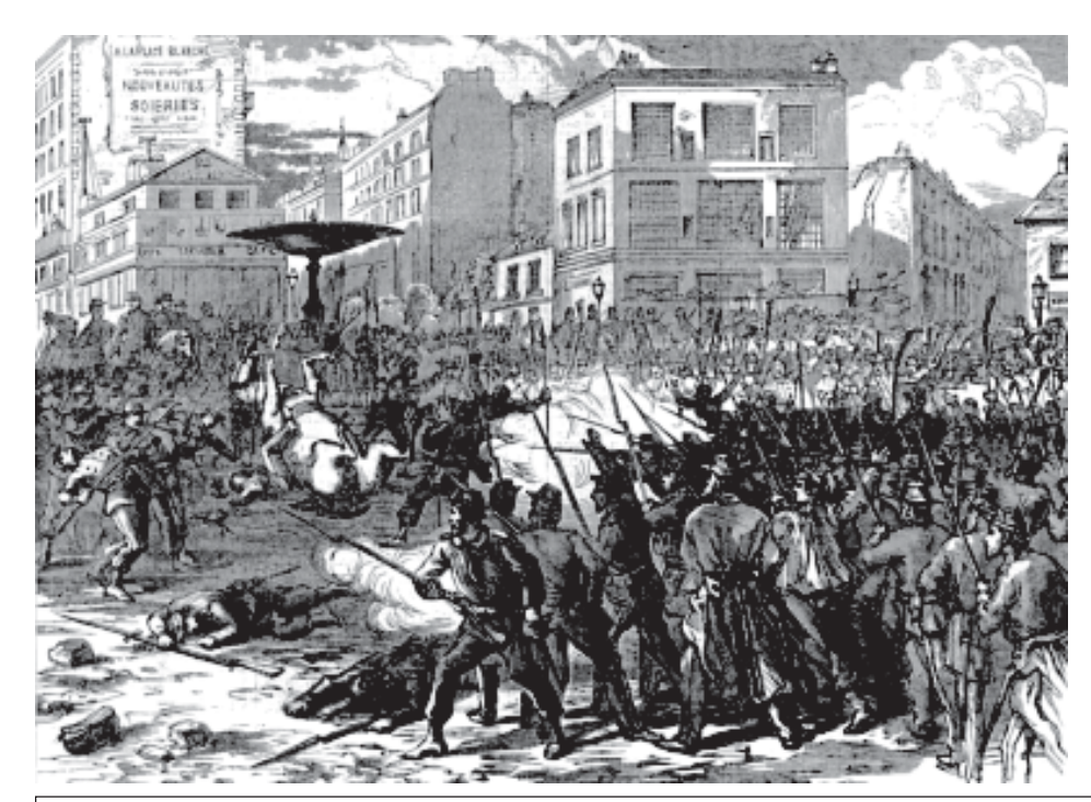
Fig. 2 – This is a painting of the Paris Commune of 1871 (From Illustrated London News, 1871). It portrays a scene from the popular uprising in Paris between March and May 1871. This was a period when the town council (commune) of Paris was taken over by a 'peoples' government' consisting of workers, ordinary people, professionals, political activists and others. The uprising emerged against a background of growing discontent against the policies of the French state. The 'Paris Commune' was ultimately crushed by government troops but it was celebrated by Socialists the world over as a prelude to a socialist revolution. The Paris Commune is also popularly remembered for two important legacies: one, for its association with the workers' red flag – that was the flag adopted by the communards (revolutionaries) in Paris; two, for the 'Marseillaise', originally written as a war song in 1792, it became a symbol of the Commune and of the struggle for liberty.