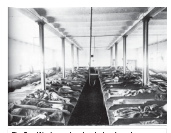
Fig.6 – Workers sleeping in bunkers in a dormitory in pre-revolutionary Russia. They slept in shifts and could not keep their families with them.