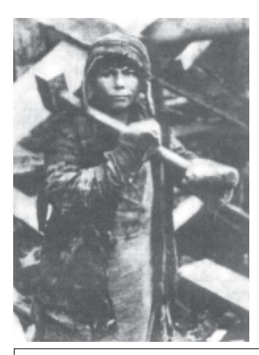
Fig. 16 – A child in Magnitogorsk during the First Five Year Plan.