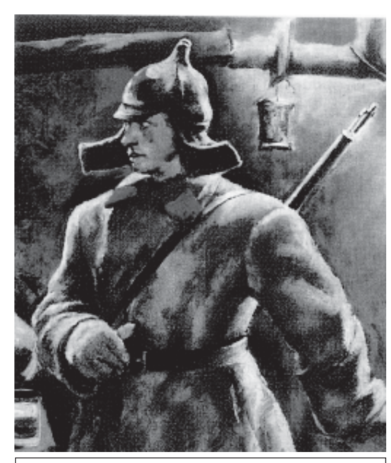
Fig. 12 – A soldier wearing the Soviet hat (budeonovka).

at Brest Litovsk. In the years that followed, the Bolsheviks became the only party to participate in the elections to the All Russian Congress of Soviets, which became the Parliament of the country. Russia became a one-party state. Trade unions were kept under party control. The secret police (called the Cheka first, and later OGPU and NKVD) punished criticised those who Bolsheviks. Many young writers and artists rallied to the Party because it stood for socialism and for change. After October 1917, this led to experiments in the arts and architecture. But many became disillusioned because of the censorship the Party encouraged.