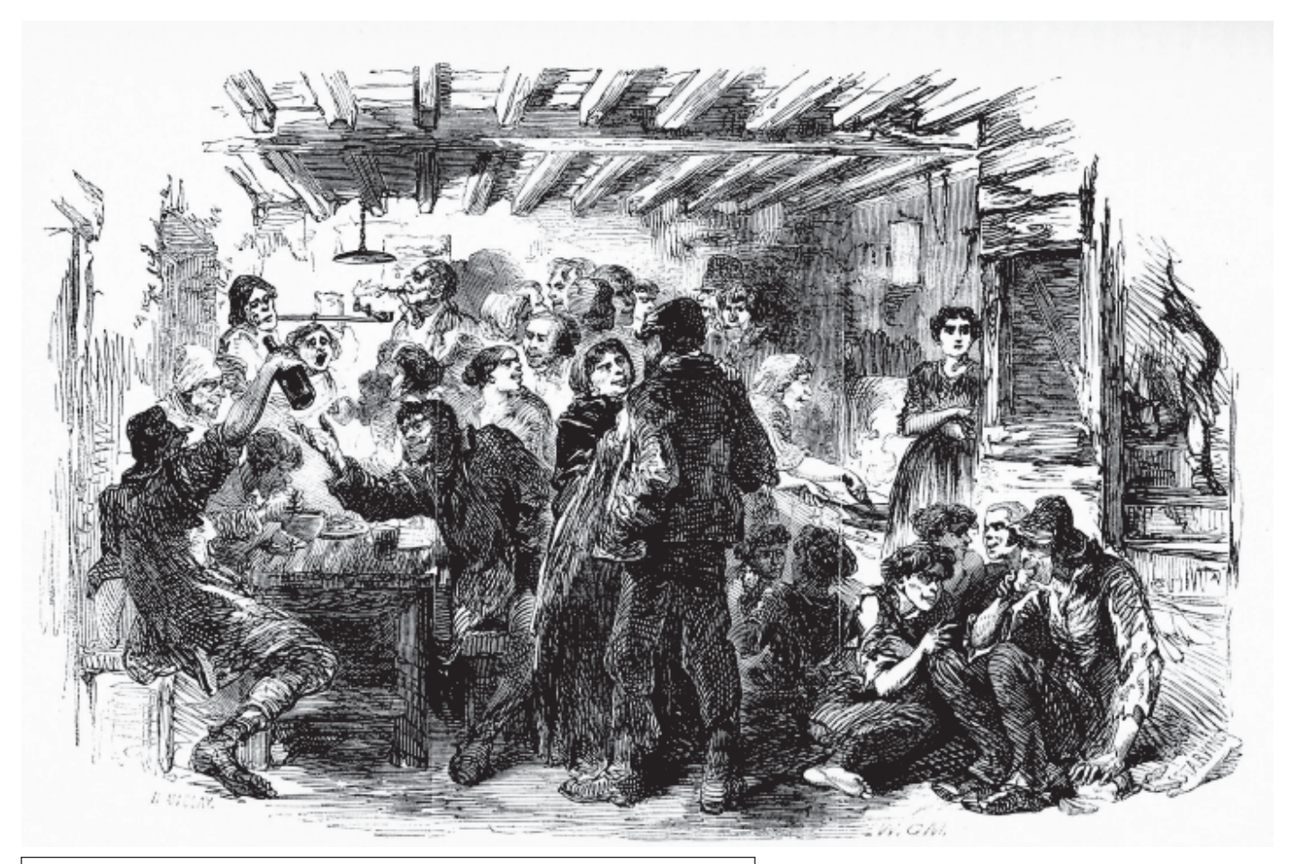
Fig. 1 – The London poor in the mid-nineteenth century as seen by a contemporary.

From: Henry Mayhew, London Labour and the London Poor, 1861.