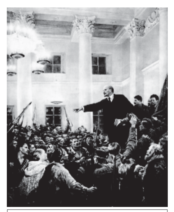
Fig. 9 – A Bolshevik image of Lenin addressing workers in April 1917.

Meanwhile in the countryside, peasants and their Socialist Revolutionary leaders pressed for a redistribution of land. Land committees were formed to handle this. Encouraged by the Socialist Revolutionaries, peasants seized land between July and September 1917.