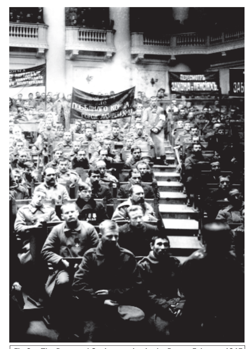
Fig.8 – The Petrograd Soviet meeting in the Duma, February 1917.

On Sunday, 25 February, the government suspended the Duma. Politicians spoke out against the measure. Demonstrators returned in force to the streets of the left bank on the 26th. On the 27th, the Police Headquarters were ransacked. The streets thronged with people raising slogans about bread, wages, better hours and democracy. The government tried to control the situation and called out the cavalry once again. However, the cavalry refused to fire on the demonstrators. An officer was shot at the barracks of a regiment and three other regiments mutinied, voting to join the striking workers. By that evening, soldiers and