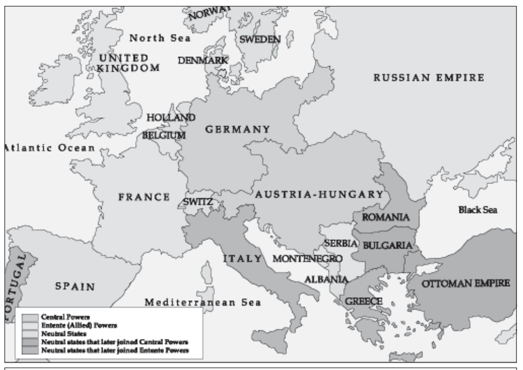
Fig.4 – Europe in 1914. The map shows the Russian empire and the European countries at war during the First World War.