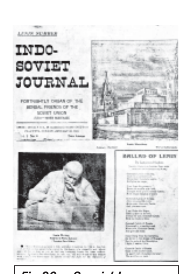
Fig.20 – Special Issue on Lenin of the Indo-Soviet Journal. Indian communists mobilised support for the USSR during the Second World War.