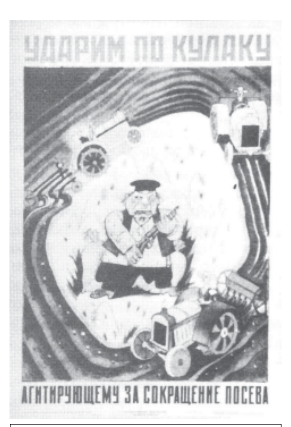
Fig. 18 – A poster during collectivisation. It states: 'We shall strike at the kulak working for the decrease in cultivation.'

Deported – Forcibly removed from one's own country. Exiled – Forced to live away from one's own country.