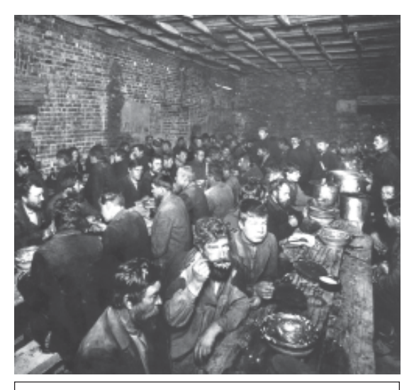
Fig.5 – Unemployed peasants in pre-war St Petersburg. Many survived by eating at charitable kitchens and living in poorhouses.

In the countryside, peasants cultivated most of the land. But the nobility, the crown and the Orthodox Church owned large properties. Like workers, peasants too were divided. They were also