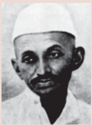
Fig.29 – 1920. Wearing the Gandhi cap.