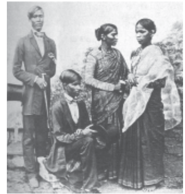
Fig. 11 – Converts to Christianity in Goa in 1907, who have adopted Western dress.