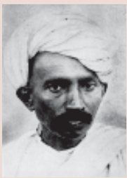
Fig.27 – 1915. Mahatma Gandhi with a turban.

Large numbers of nationalists defiantly wore the Gandhi cap and were even beaten or arrested for doing so. With the rise of the Khilafat movement in the post-First World War years, the fez, a tasseled Turkish cap, became a sign of anti-colonialism in India. Though many Hindus – as in Hyderabad for instance – also wore the fez, it soon became identified solely with Muslims.