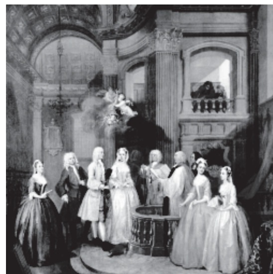
Fig.6 – Scene at an upper-class wedding by the English painter William Hogarth (1697-1764)

But not everyone accepted these values. Over the nineteenth century, ideas changed. By the 1830s, women in England began agitating for democratic rights. As the suffrage movement developed, many began campaigning for dress reform. Women's magazines described how tight dresses and corsets caused deformities and illness among young