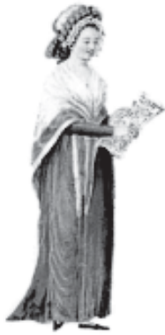
Fig.3 – Woman of the middle classes, 1791.