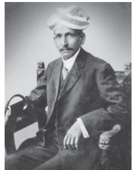
Fig. 15 – Sir M. Visveswaraya. A leading engineer-technocrat and the Dewan of Mysore state from 1912 to 1918. He wore a turban with his three-piece Western style suit.