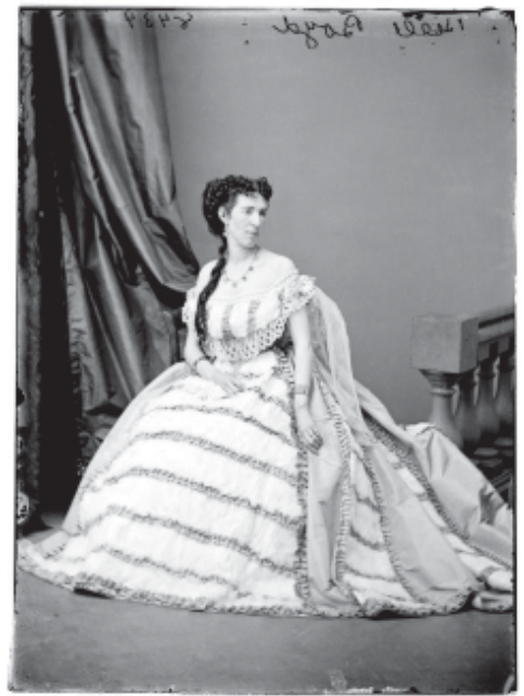
Fig.8 – A woman in nineteenth-century USA, before the dress reforms. Notice the flowing gown sweeping the ground. Reformers reacted to this type of clothing for women.

By the end of the nineteenth century, however, change was clearly in the air. Ideals of beauty and styles of clothing were both transformed under a variety of pressures. People began accepting the ideas of reformers they had earlier ridiculed. With new times came new values.