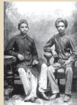
Fig. 22 – Mahatma Gandhi at age 14, with a friend.