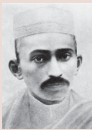
Fig.28 – 1915. In an embroidered Kashmiri cap.