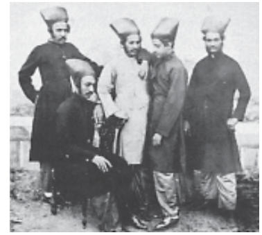
Fig. 10 – Parsis in Bombay, 1863.