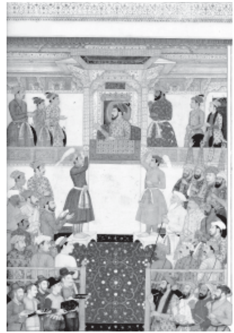
Fig. 14 – Europeans bringing gifts to Shah Jehan, Agra, 1633, from the Padshahnama. Notice the European visitors’ hats at the bottom of the picture, creating a contrast with the turbans of the courtiers.

Today, the Mysore turban is used largely on ceremonial occasions and to honour visiting dignitaries.