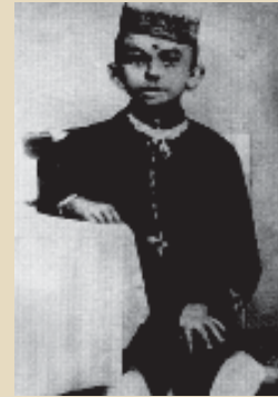
Fig. 21 – Mahatma Gandhi in his earliest known picture, aged 7.

On his return to India in 1915, he decided to dress like a Kathiawadi peasant. Only in 1921 did he adopt the short dhoti, the form of dress he wore until his death. On 2 September 1921, a year after launching the non-cooperation movement, which sought swaraj in one year, he announced: