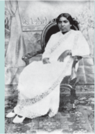
Fig. 19 – Maharani of Travancore (1930). Note the Western shoes and the modest long-sleeved blouse. This style had become common among the upper classes by the early twentieth century.

Soudamini Khastagiri, Striloker Paricchad (1872)