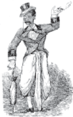
Fig. 13 – Cartoon from Indian Charivari, 1873.

Three. Some men resolved this dilemma by wearing Western clothes without giving up their Indian ones. Many Bengali bureaucrats in the late nineteenth century began stocking western-style clothes for work outside the home and changed into more comfortable Indian clothes at home. Early-twentieth-century anthropologist Verrier Elwin remembered that policemen in Poona who were going off duty would take their