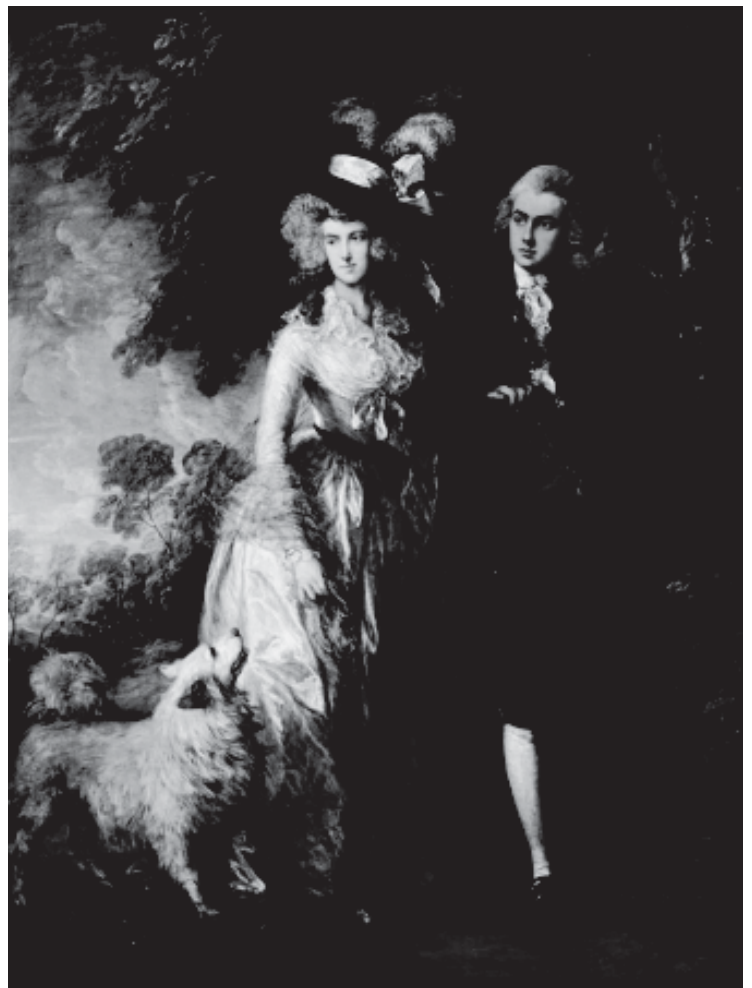
Fig. 1 – An upper-class couple in eighteenth-century England. Painting by the English artist Thomas Gainsborough (1727-1788)

The French Revolution ended these distinctions. As you know from Chapter I, members of the Jacobin clubs even called themselves the ‘sans culottes’ to distinguish themselves from the aristocracy who wore the fashionable ‘knee breeches’. Sans culottes literally meant those ‘without knee breeches’. From now on, both men and women began wearing clothing that was loose and comfortable. The colours of France – blue, white and red – became popular as they were a sign of the patriotic citizen. Other political symbols too became a part of dress: the red cap of liberty, long trousers and the revolutionary cockade pinned on to a hat. The simplicity of clothing was meant to express the idea of equality.