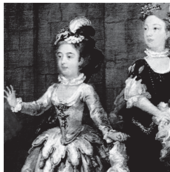
Fig.7 – A child in an aristocratic household by the English painter William Hogarth (1697-1764). Notice the tiny waist even at this age, probably held in by a corset, and the sweeping gown which would restrict her movement.