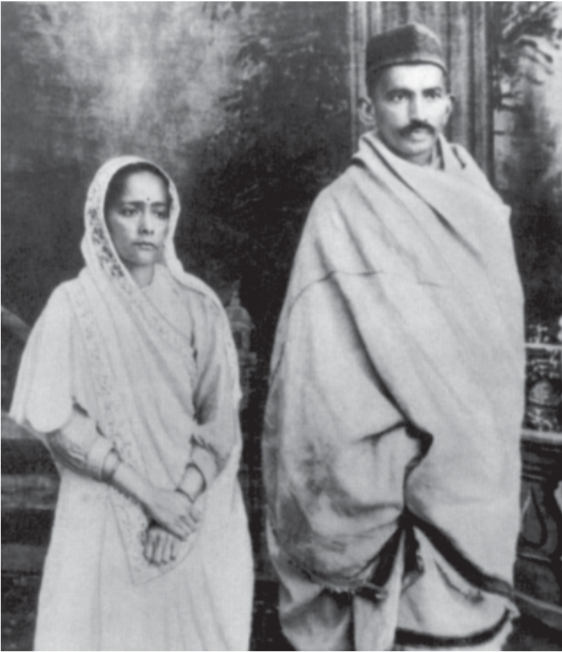
Fig.26 – Mahatma Gandhi with Kasturba, shortly after his return from South Africa. Dressed simply, he later confessed to feeling awkward amongst the Westernised Bombay elite. He said that he was more at home among the labourers in South Africa.

‘I propose to discard at least up to 31st of October my topi and vest and to content myself with a loincloth, and a chaddar whenever necessary for protection of my body. I adopt the change because I have always hesitated to advise anything I may not be prepared to follow ...’