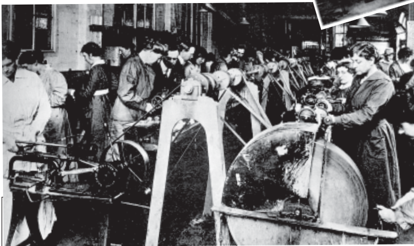
Fig.9 – Changes in clothing in the early twentieth century.

Fig.9a – Even for middle- and upper-class women, clothing styles changed. Skirts became shorter and frills were done away with.