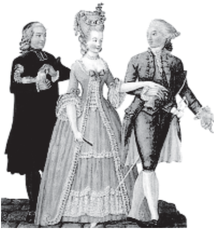
Fig.2 – An aristocratic couple on the eve of the French Revolution. Notice the sumptuous clothing, the elaborate headgear, and the lace edgings on the dress the lady is wearing. She also has a corset inside the dress. This was meant to confine and shape her waist so that she appeared narrow waisted. The nobleman, as was the custom of the time, is wearing a long soldier's coat, knee breeches, silk stockings and high heeled shoes. Both of them have elaborate wigs and both have their faces painted a delicate shade of pink, for the display of natural skin was considered uncultured.