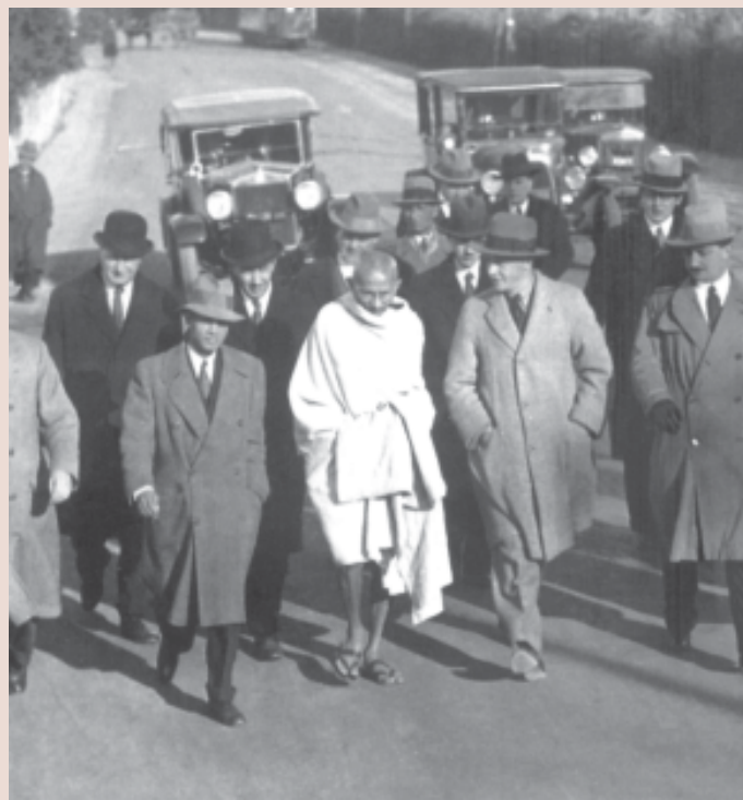
Fig.31 – On his visit to Europe in 1931. By now his clothes had become a powerful political statement against Western cultural domination.