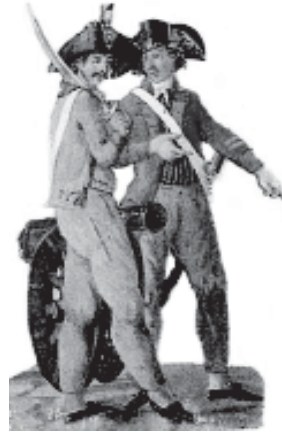
Fig.4 – Volunteers during the French Revolution.