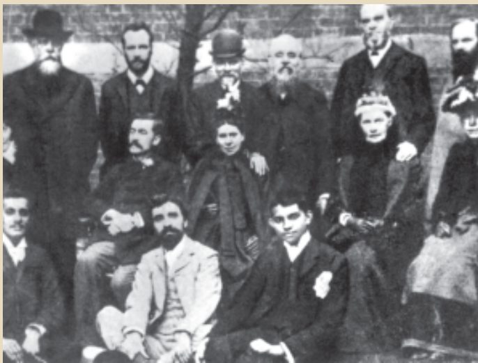
Fig. 23 – Mahatma Gandhi (seated front right) London, 1890, at the age of 21. Note the typical Western three-piece suit.