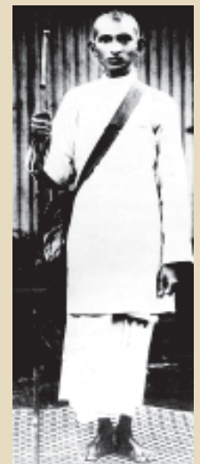
Fig. 25 – In 1913 in South Africa, dressed for Satyagraha