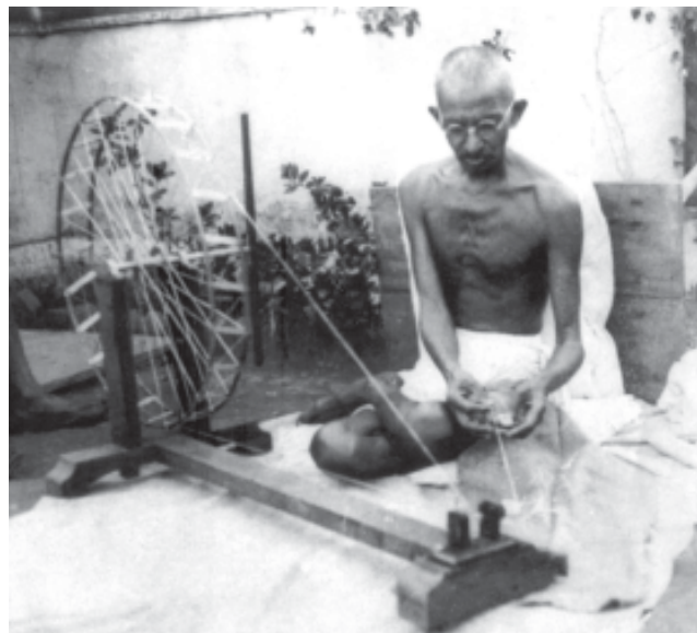
Fig.20 – The familiar image of Mahatma Gandhi, bare chested and at his spinning wheel.

If you were a poor peasant would you have willingly taken to giving up mill-made cloth?