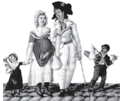
Fig.5 – A sans-culottes family, 1793.