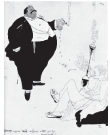
Fig. 12 – Cartoon, 'The Modern Patriot', by Gaganendranath Tagore, early twentieth century. A sarcastic picture of a foolish man who copies western dress but claims to love his motherland with all his heart. The pot-bellied man with cigarette and Western clothes was ridiculed in many cartoons of the time.